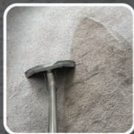
Carpet & Rug Cleaning