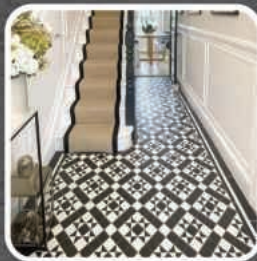
Stone and Tile Restoration